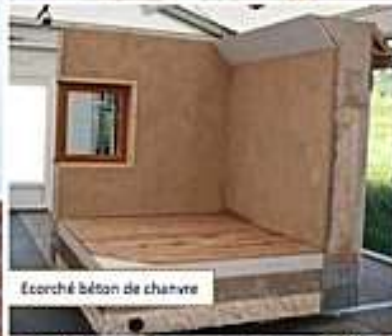
Ecorché béton de chanvre