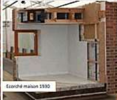
Ecorché maison 1930