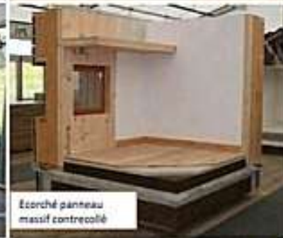
Ecorché panneau massif contre-collé