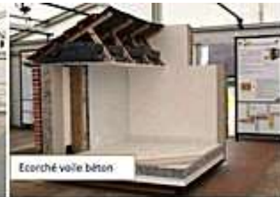
Ecorché voile béton