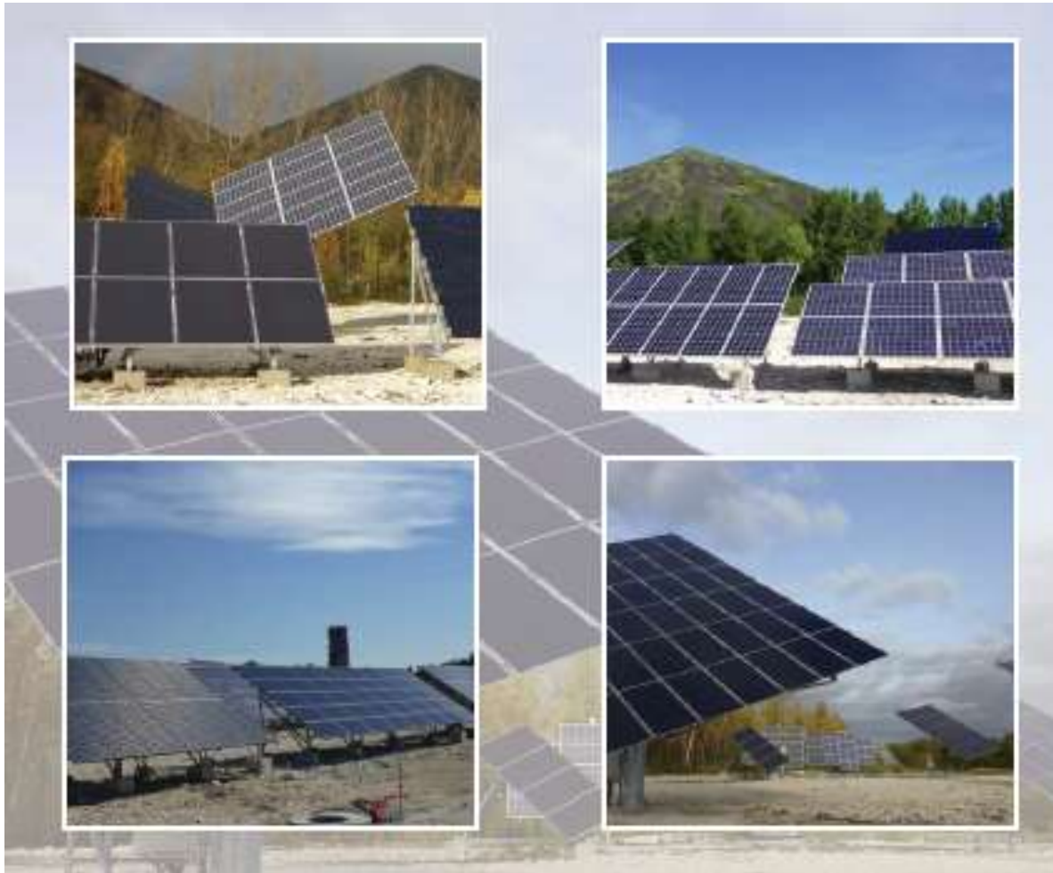
Solar test center LUMIWATT