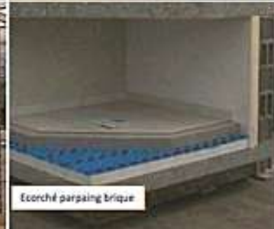
Ecorché parpaing brique