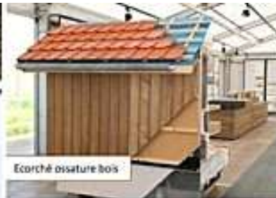
Ecorché ossature bois